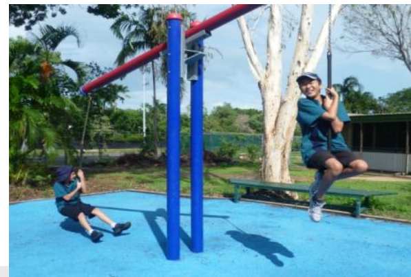
Up, up and away!