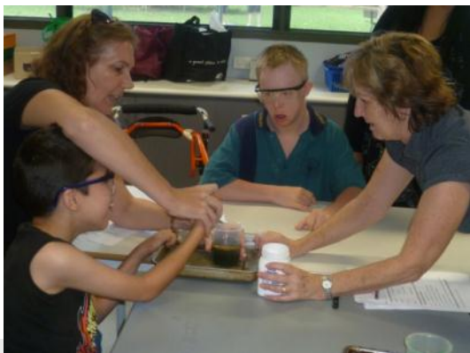
Anticipating a chemical reaction.