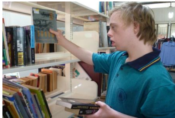
The Op Shop is looking good.