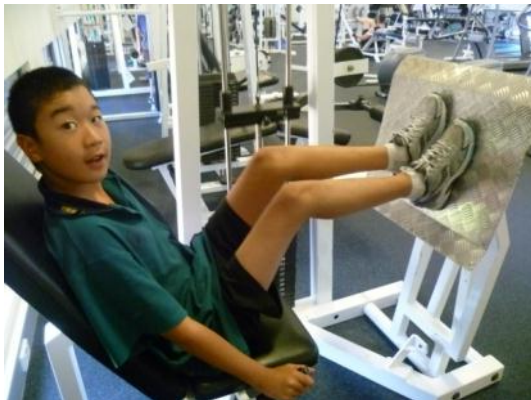
Pushing weight uphill.