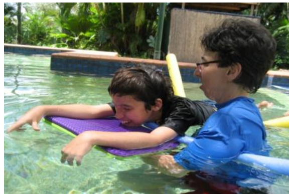
Floating at the pool is cool.