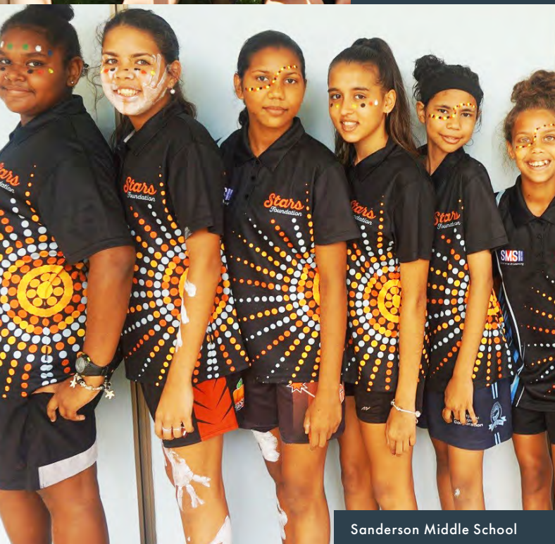
Sanderson Middle School