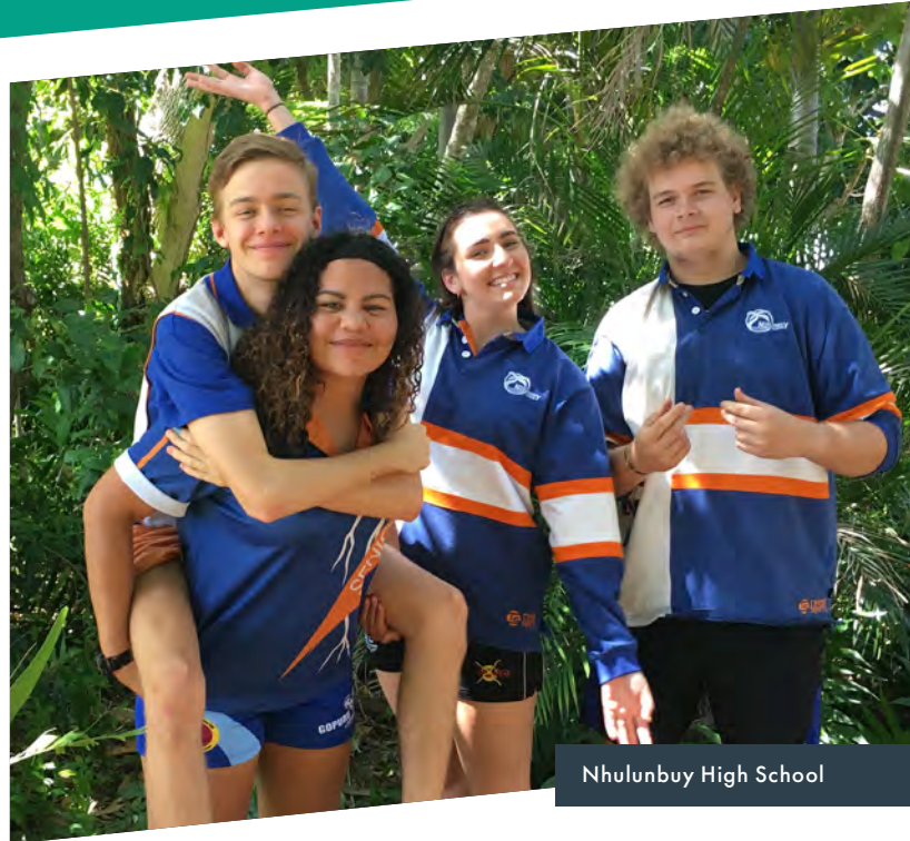
Nhulunbuy High School

In 2017 COGSO lodged a submission to the Federal Government Inquiry into Hearing Health and Wellbeing of Australia. We were then invited by the Senate Inquiry members to respond to COGSO's submission. We have also formed a Hearing in Education Learning Program (HELP) working group between COGSO, NT Departments of Health, Education and AMSANT.