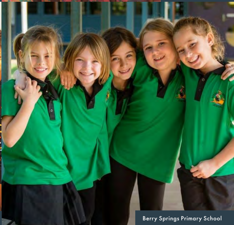
Berry Springs Primary School

NORTHERN TERRITORY COUNCIL OF GOVERNMENT SCHOOL ORGANISATIONS (COGSO)