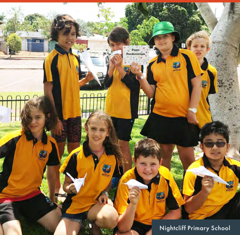
Nightcliff Primary School