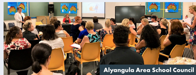
Alyangula Area School Council