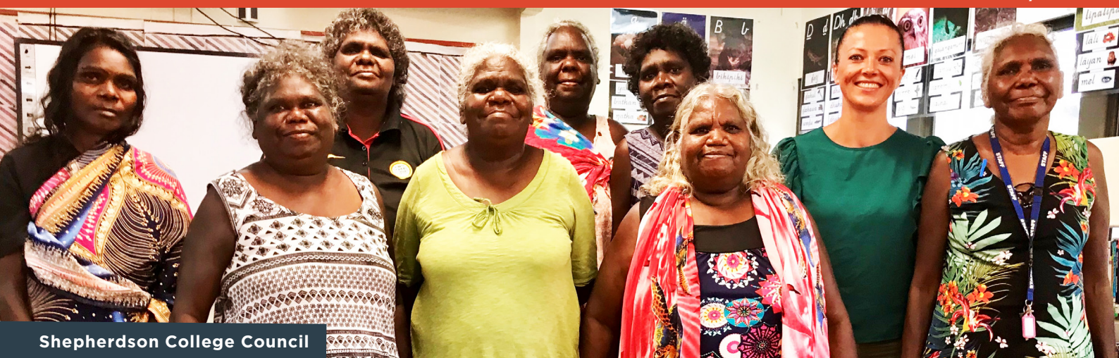
Shepherdson College Council