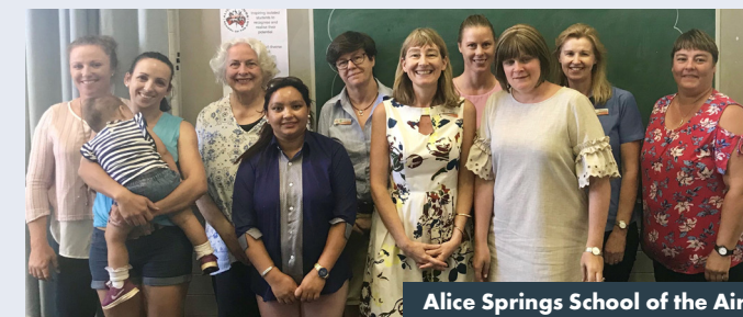
Alice Springs School of the Air

Alice Springs School of the Air parents were gathered in Alice Springs during an in-school week for students which provided the perfect opportunity for NT COGSO to deliver Governance training. Thank you to the dedicated group of parents who travelled from various remote locations to attend and who continue to support the Principal and staff to inspire isolated students to engage and achieve the best possible learning outcomes.