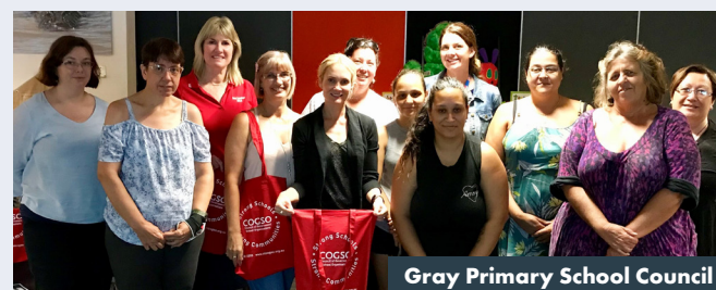
Gray Primary School Council

Great things are happening at Gray Primary School! After completing Governance training, NT COGSO was invited back to support the School Council with their AGM. Council takes great pride in sustaining and continuing to build strong community school partnerships with numerous successes celebrated through the Principal and Chair reports.