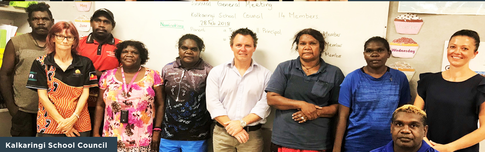
Kalkaringi School Council

NORTHERN TERRITORY COUNCIL OF GOVERNMENT SCHOOL ORGANISATIONS