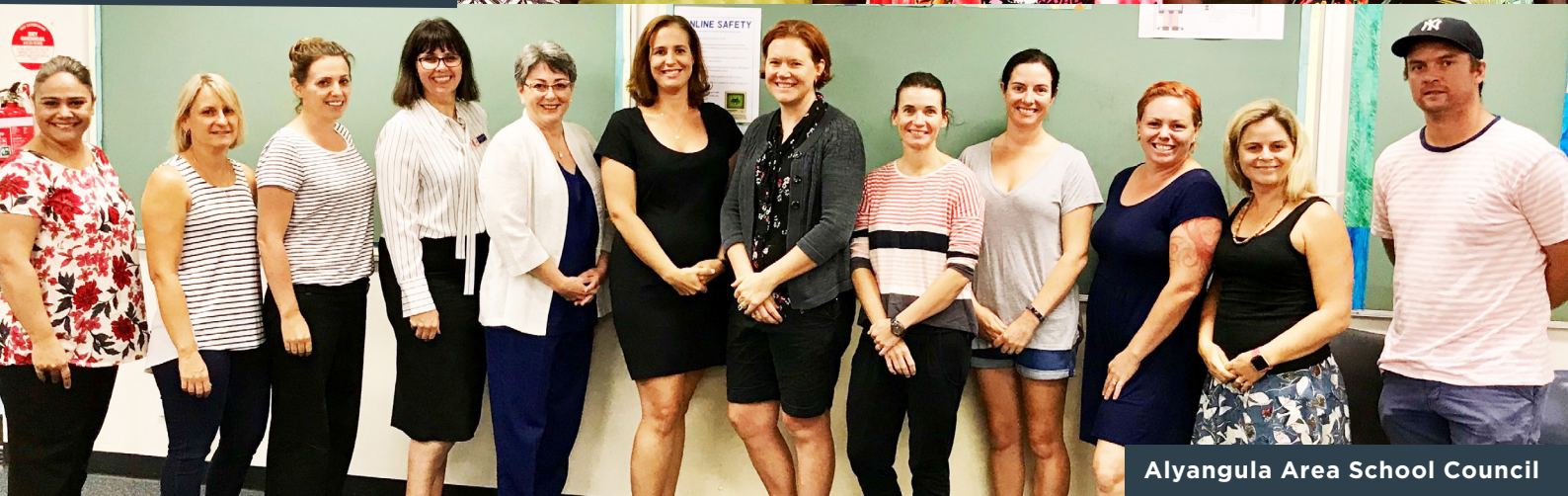
Alyangula Area School Council