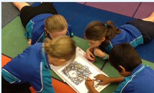
Collaborative work to build language skills