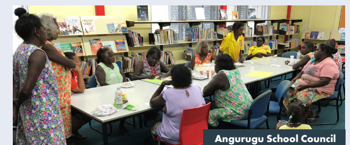
Angurugu School Council

NT COGSO worked with members of the Angurugu Community to re-engage a positive and proactive School Council. Discussions were held about how the school Constitution could be amended to ensure School Council membership and composition was truly reflective of the community. Through inclusive and collaborative discussions, members of the community were excited about the upcoming AGM and the positive future for the School Council in supporting Angurugu students and the school.