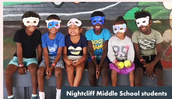
Nightcliff Middle School students

You won't be surprised to learn that taking notice of the positive things in our day boosts our positive emotions. But you might be interested to