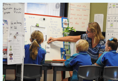
A Read Write Inc Lesson in progress

Teachers at Dundee Beach know that while conversational speaking skills mostly develop naturally, reading and academic writing require purposeful, intentional teaching.