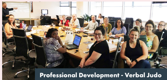
Professional Development - Verbal Judo

Also observing the positive impact of initiatives such as the Families as First Teachers program with 10 new programs established across the Territory providing more support for young children and their families.