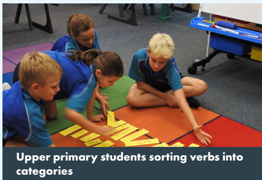
Upper primary students sorting verbs into categories

IN 2018 DUNDEE BEACH SCHOOL IS FOCUSING ON IMPROVING STUDENTS' WRITING SKILLS.