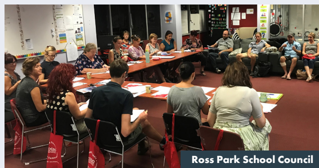
Ross Park School Council

The Ross Park Primary School Council AGM and Governance training were attended by over 20 members of the school community. It was wonderful to hear from the Principal and Chair on the successes of the school in 2017. Ross Park Primary School elected new Parent Members and held a training session on School Council functions and Governing v Managing. The new Council is ready to apply their new-found knowledge in the year ahead!