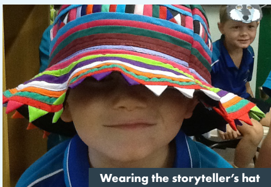
Wearing the storyteller's hat