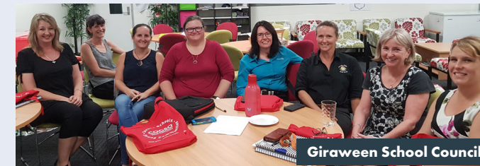
Girraween School Council

With new Parent Members elected, the Council was enthusiastic to commence the year with Governance Training. Council Members were engaged and asked lots of great questions during the session. A strong School Council partnered with the Principal creates and sustains a meaningful school community where children can reach their fullest potential.