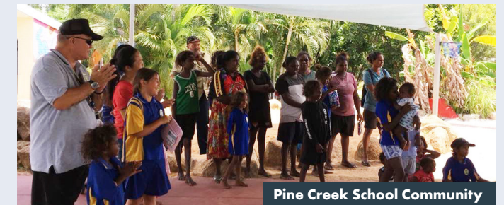
Pine Creek School Community

Parents and community members joined a Governance training session to learn more about the functions of a School Council and how everyone can work together in a productive partnership to achieve the best possible outcomes for the children at Pine Creek School.