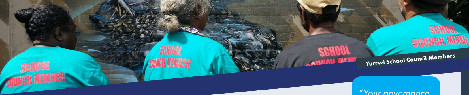
Yurrwi School Council Members

"Fantastic night of information. Thank you so much. Very professional."