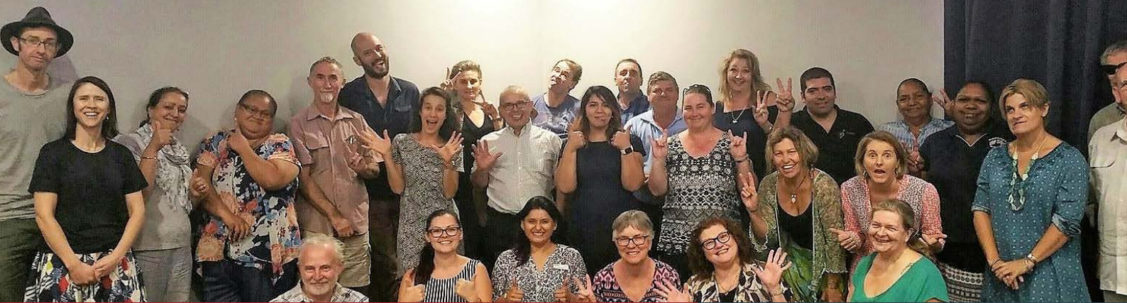
NT COGSO's Strong Programs - Strong Children Workshop