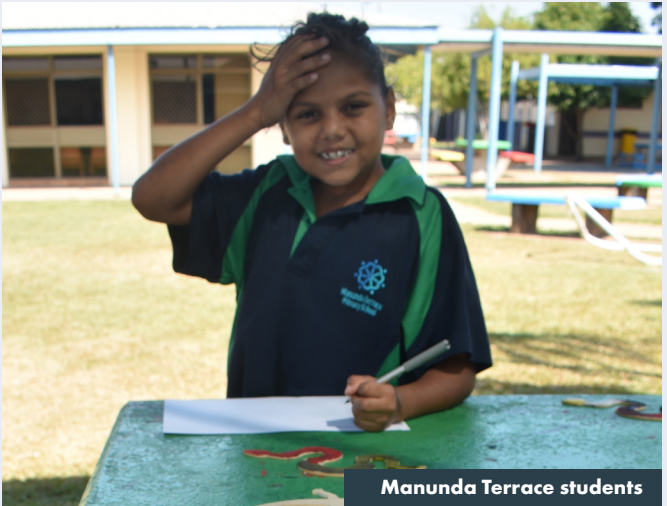
Manunda Terrace students

Students are participating in Greek cooking, Torres Strait Islander dancing, bush tucker, painting a mural, singing, learning language plus many others. Connecting Cultures is a great program supported by School Council.