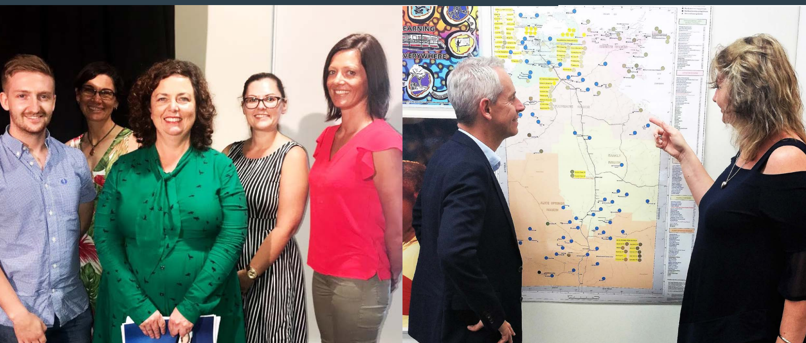
NT COGSO staff with Minister for Territory Families Dale Wakefield