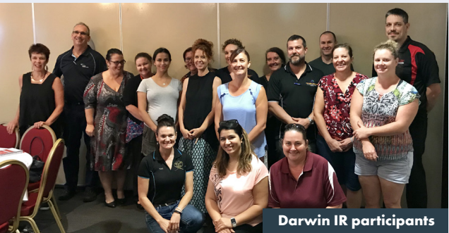
Darwin IR participants

Regional Governance, Industrial Relations and Financial Governance training sessions have rolled out in the Darwin and Palmerston & Rural Regions in Term 2.