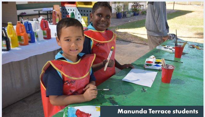
Manunda Terrace students

Each Friday in Term 2 students and staff from Manunda Terrace Primary School have the opportunity to engage in quality activities that support cultural diversity.