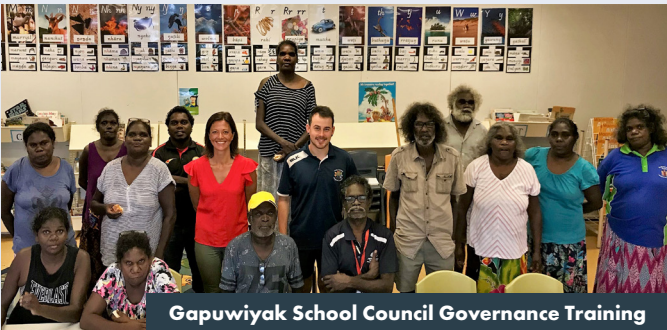
Gapuwiyak School Council Governance Training

Great things are happening at Gapuwiyak. Strong partnerships between community and schools result in strong achievements for our children. School Council Members, community members and school staff came together in Term 2 to learn more about School Council Governance.