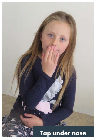
Tap under nose