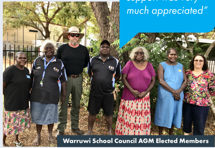
Warruwi School Council AGM Elected Members