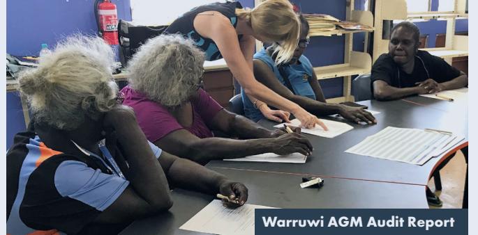
Warruwi AGM Audit Report

"Your governance support was very much appreciated"